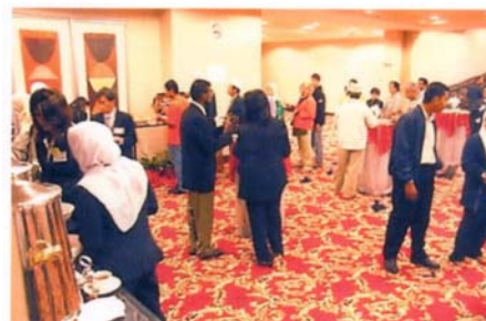
A game in progress